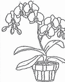
Potted Dendrobium orchids

Embark on an unforgettable journey into the diverse and colourful display of Asia's most exquisite orchids. Some orchid species on display are: Dendrobiums, Vandas and Epidendrums.