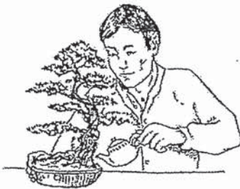
Caring for a Bonsai