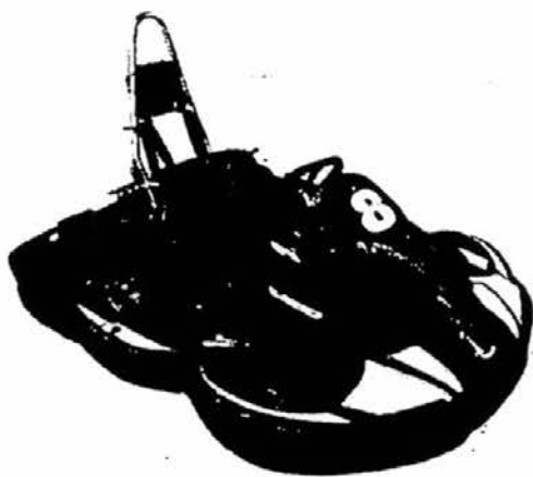
Honda GX270cc E85 Fueled-Engine